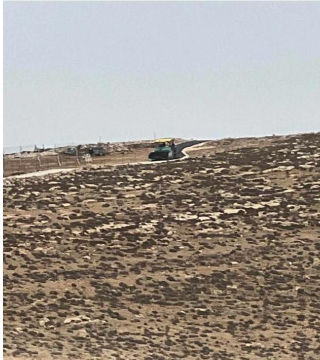
Road opening to a new outpost on the borders of the village of Beit Awwa, Hebron area.

intensified their efforts to create new realities through activities like road incursions , establishing outposts, and seizing new territories.