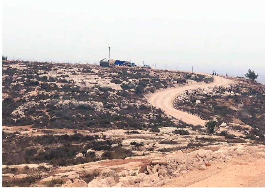
The founding of the outpost near Ras Karkar, 2 October 2018

Usually after efforts and even legal battles in order to obtain budget information from the authorities, the information is revealed only after the action has been taken on the ground. Therefore, for most of the new outposts we still do not have evidence of the involvement from various authorities, but the information that nonetheless exists here indicates that the following bodies are involved in the establishment of the outposts: the settlers local authorities, Amana, the Settlement Division, and even the Ministry of Education (see details at the list of the new outposts below).