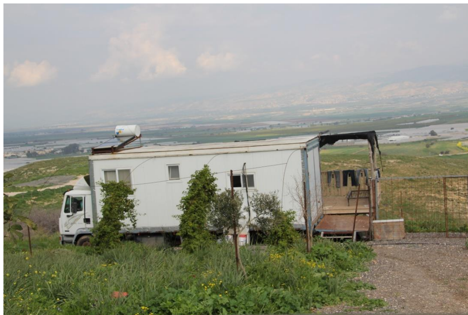
Trucks converted into housing, Shirat Haesevim, December 2017

Infrastructure and roads – "To maintain the families and the flock, basic infrastructure work will be carried out – a road, water and the like." Especially in recent months, settlers have built many new, illegal access roads for outposts throughout the West Bank.