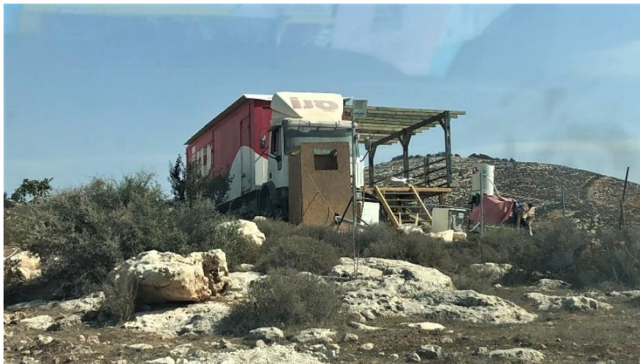
A truck converted into permanent living quarters in Negohot Farm, 24 October 2018

Trucks as housing to avoid demolition orders – According to the letter, families will live in "trucks on wheels." The reason for this is to evade demolition orders and immediate evacuation, because a truck on wheels is not considered in of itself a structure that requires a building permit. In practice, the trucks serve as a fixed structure and do not move around.