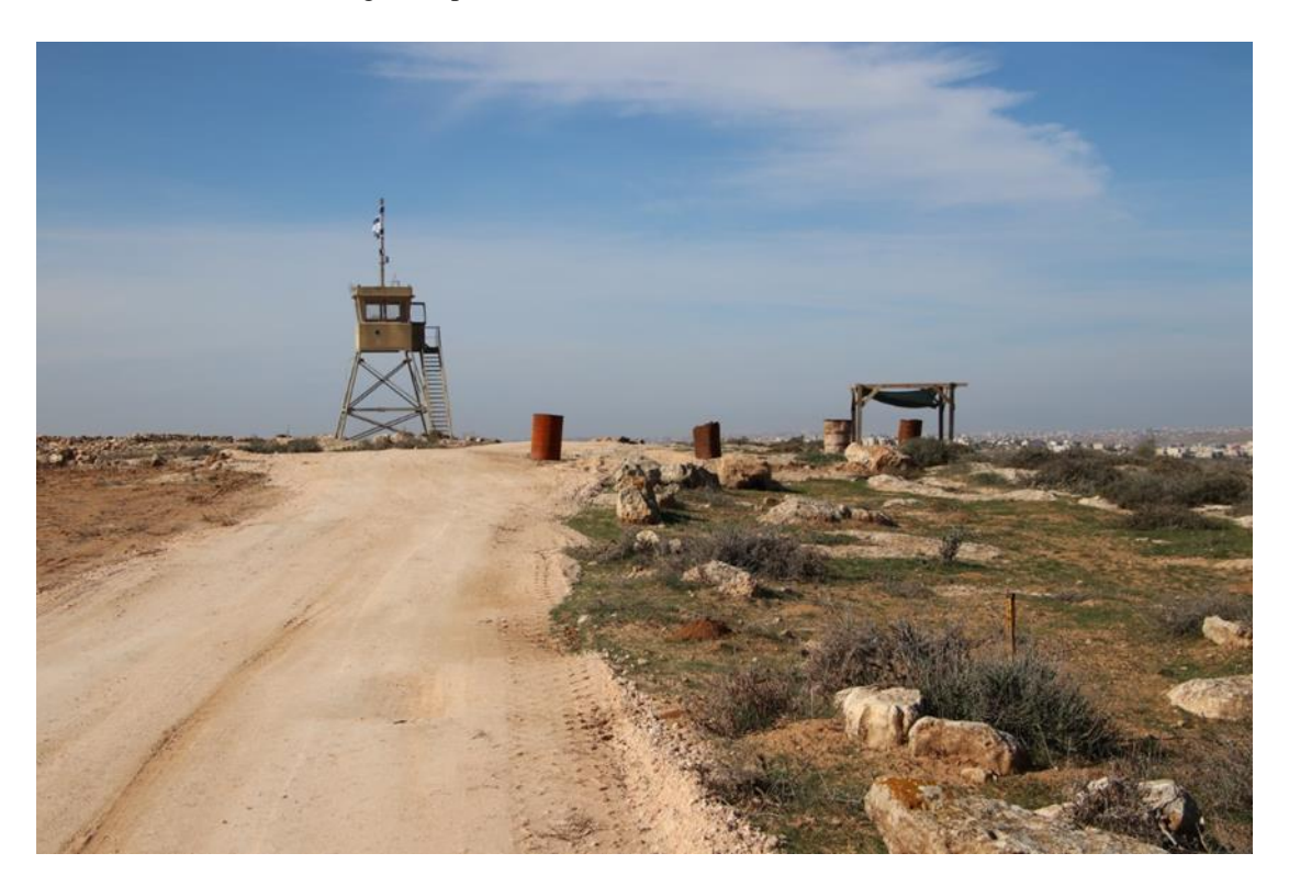
The end of a new road southern to Susiya Settlement in south Hebron Hills.