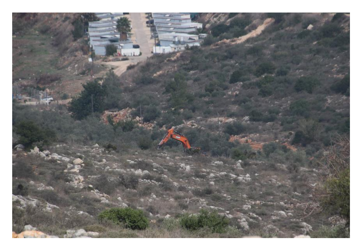
Works near the Revava settlement.