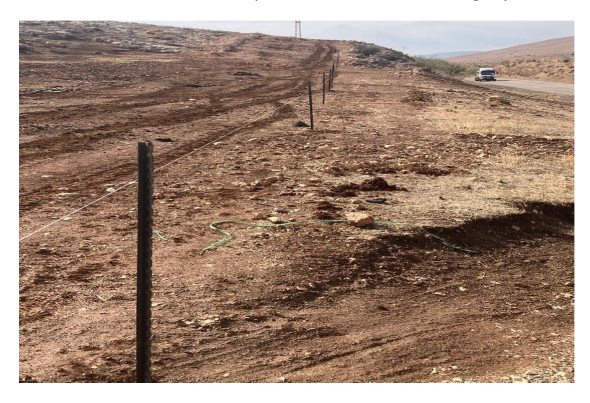
Fence along the Alon Road (Route 578) in the north of the Jordan Valley.

Additional fencing was set up near the Asa'el outpost in the south Hebron Hills region, stretching for hundreds of meters. The fencing was built along Route 317 up to the Shani Junction. Until the beginning of the war, two Palestinian Bedouin communities resided on the hill south of the road. Both communities were forcibly displaced by the settlers in October. Following this, a new outpost was established on the hill but later evicted by the Civil Administration. Instead of re-establishing the outpost (at that stage), the settlers erected fencing along the road, preventing the return of Palestinians or even their herds to the area, as they had done dozens of times in the past years.