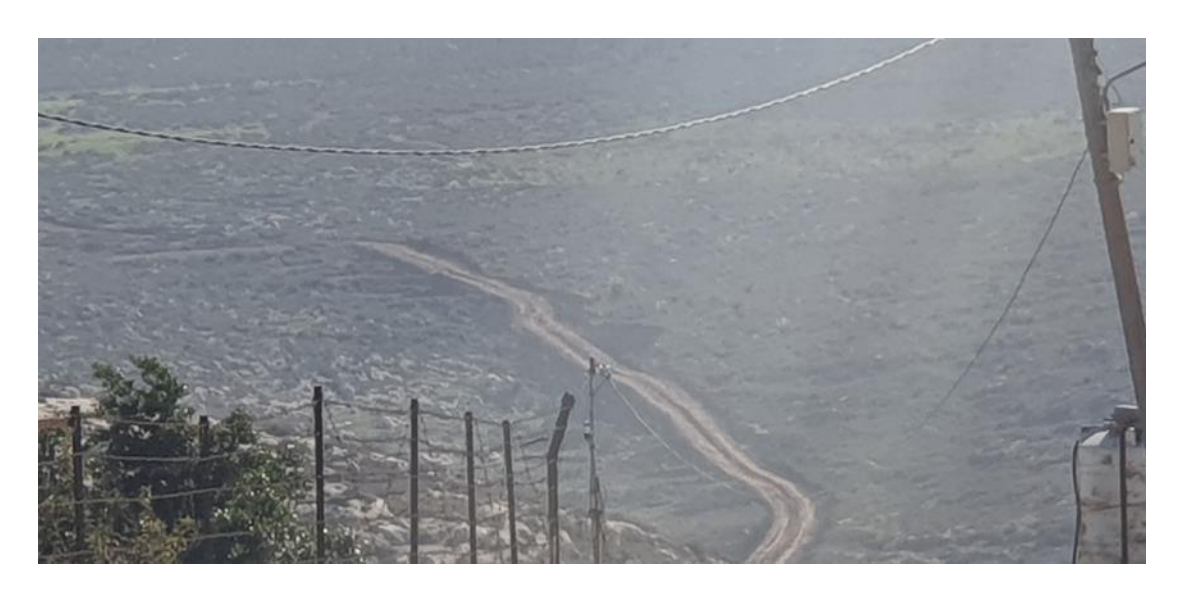
A breach road near Ein Rashash to the Alon Road.