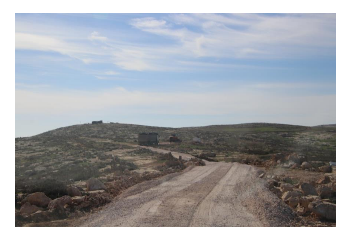
A breach of a road near Avigail outpost.