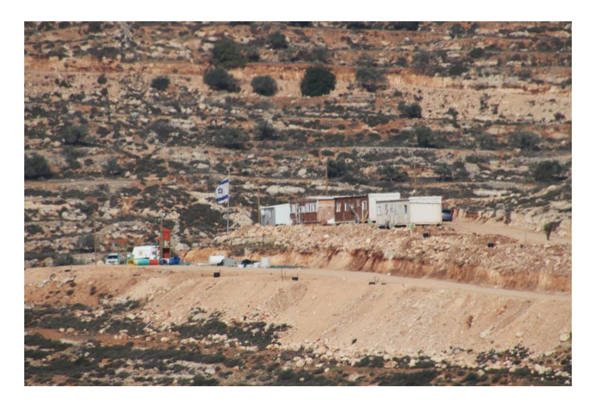
The Givat Haktora outpost between the Ali and Shiloh settlements.