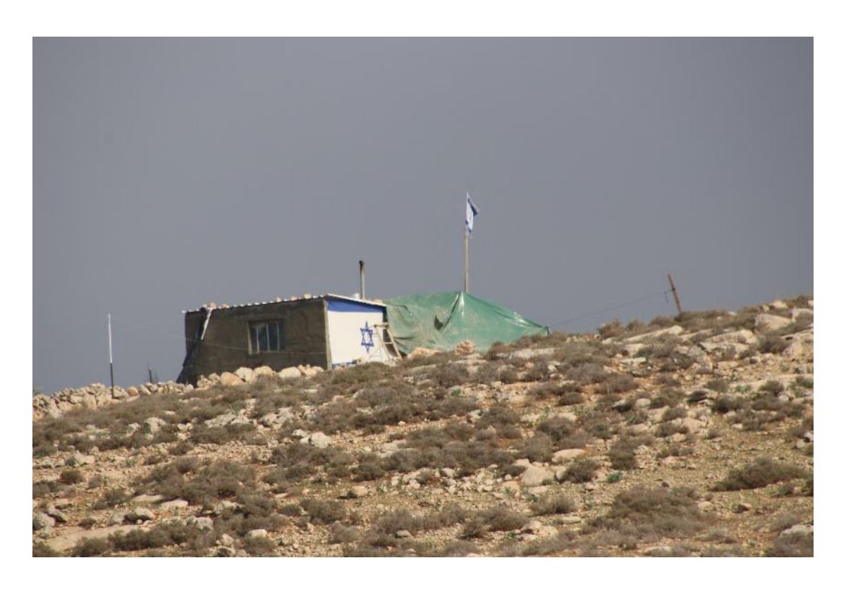
A new outpost north of the Asael outpost in the south Hebron Hill region.