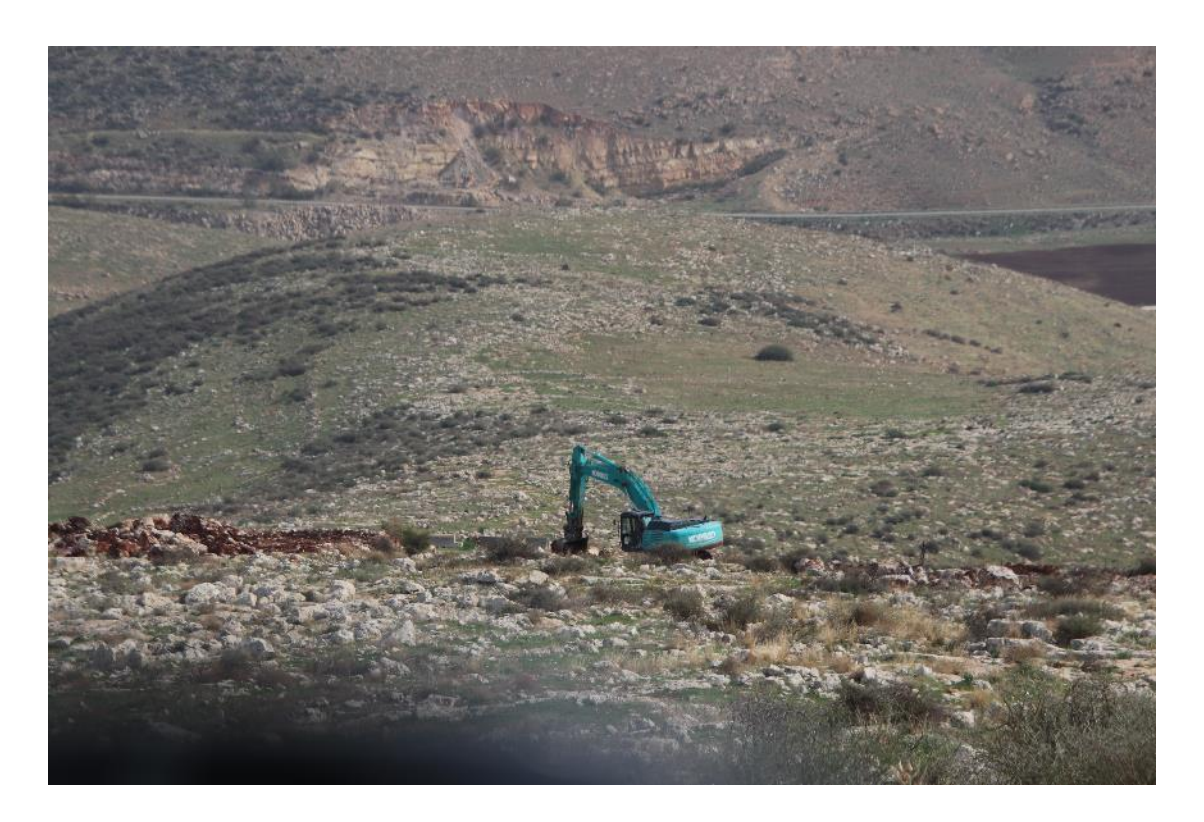
Works near the Itamar settlement.