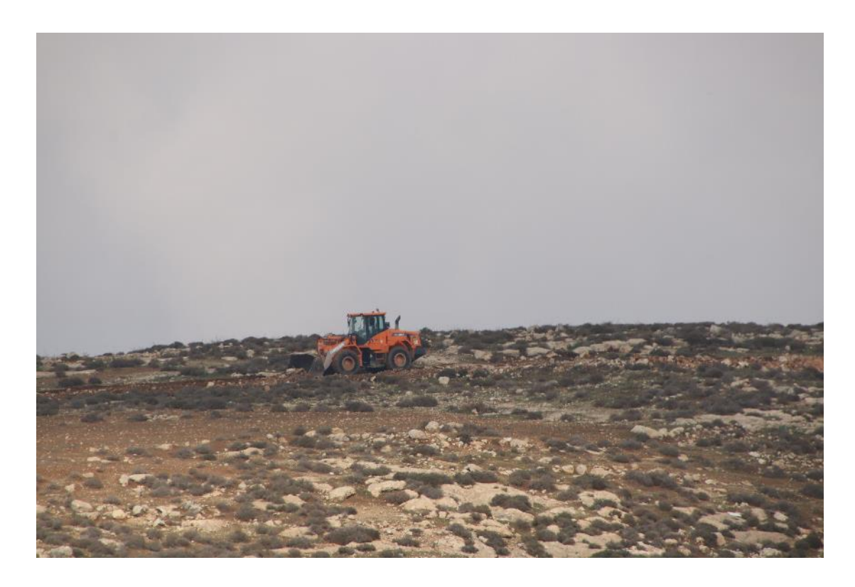
Eastern breach to the settlement of Shama in the south Hebron Hills region.