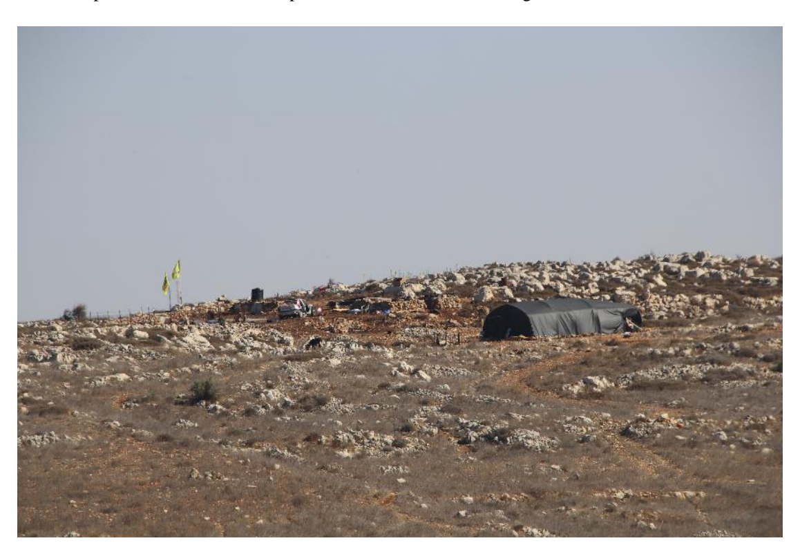
The Or Meir outpost, located south of Ofra.