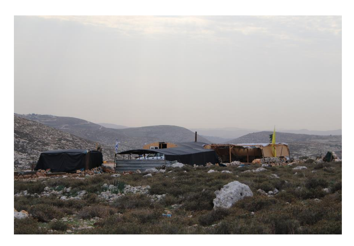
The Sde Yonatan outpost, south of the village of Dir Dibwan.