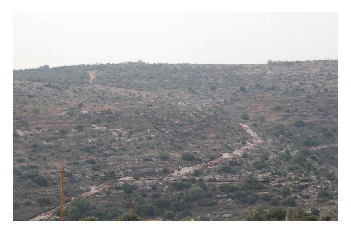
Southern road to the Ya'ir Farm settlement.