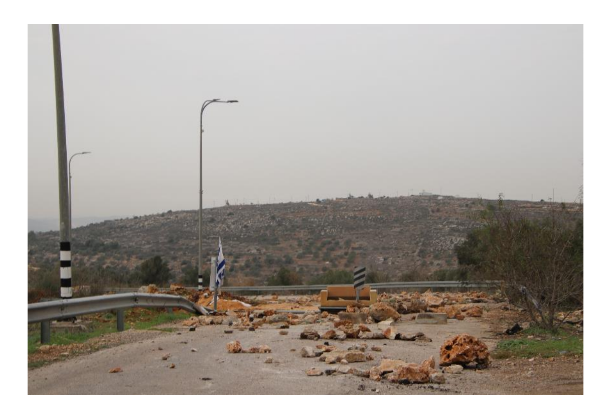
The Road to Yasuf Still Blocked by Settlers (05.12)