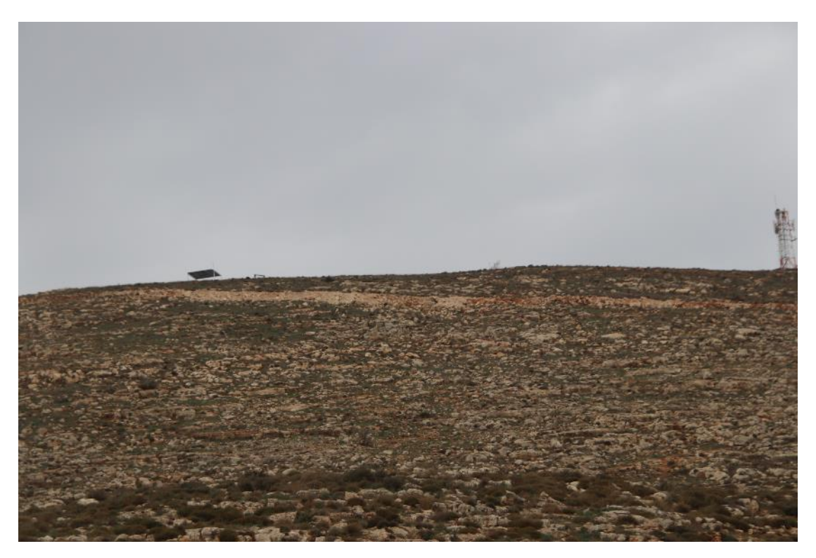
Breach of a road from the Kida East outpost towards the north.