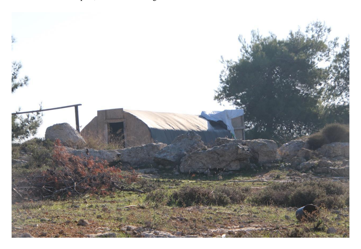
The reconstructed Yachish Zion outpost near the Psagot settlement.